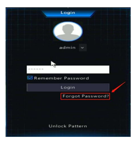
Step 2 Retrieve the password of your device by yourself on EZView under Me>General>Forgot Device Password . Scan the QR code on the Forgot Password page on the monitor so that it will send a security code to the linked email.

Click Forgot Password on your NVR's GUI and set an email address for retrieving password.